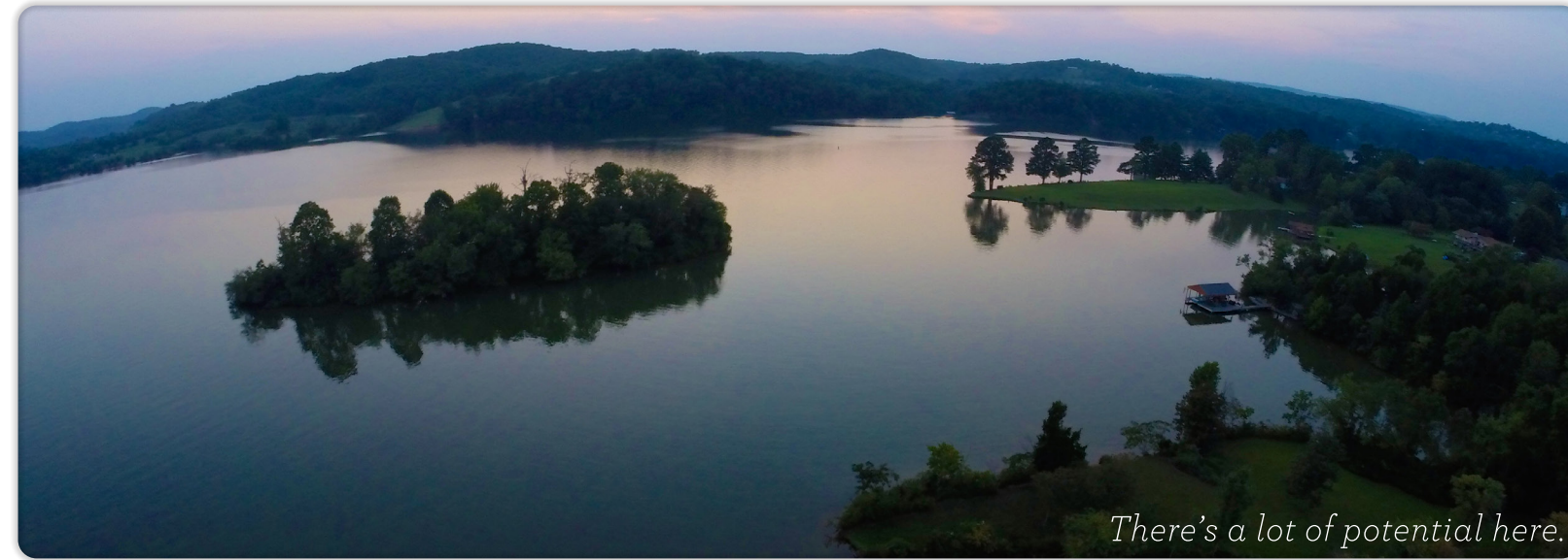
There's a lot of potential here.